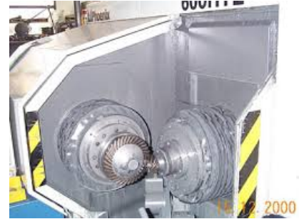
TechLap Lapping Compound